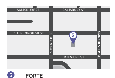
Forte 2, Ground Floor 132 Peterborough Street, Christchurch 8013

447 Papanui Road, Strowan, Christchurch 8052 Hours limited - contact for details Extremity Imaging only (Xray & CBCT)