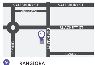
17 Durham Street, Rangiora,

Unit G3, Northwood Supa Centa 1 Radcliffe Road, Northwood Christchurch 8051 Hours 8am - 5pm weekdays